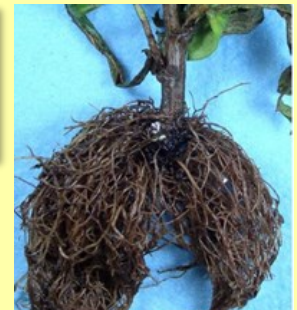
Infested Root System

This new species may not be of any more concern than other plant pathogens already on industry's radar. Introduction pathways are most likely with propagative material along with poor management practices.