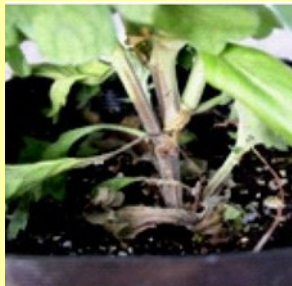
Black Stem Rot