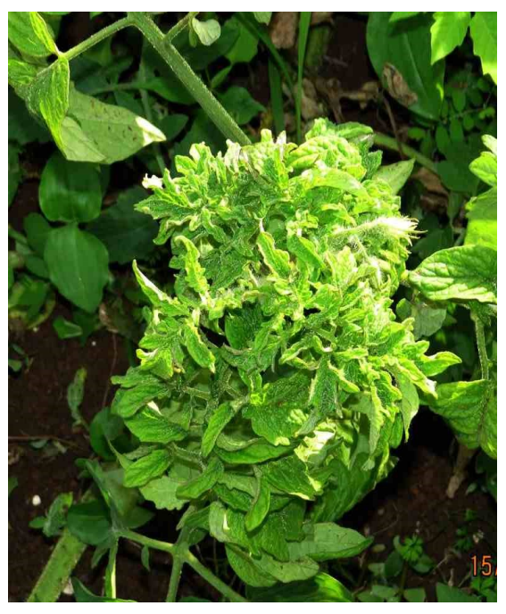
Tomato Big Bud