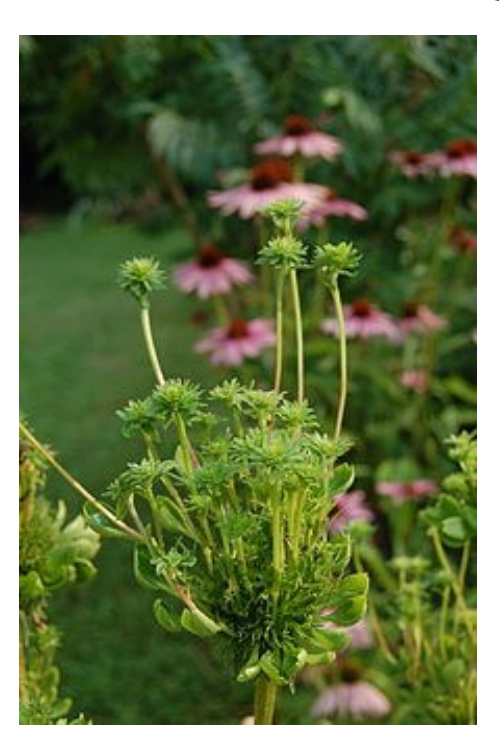
Phytoplasma in a Coneflower