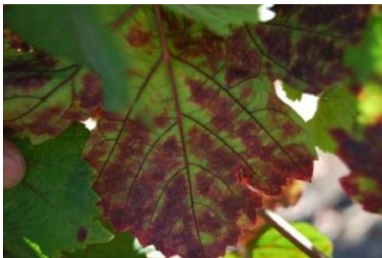
( GRVaB affected Pinot Noir )